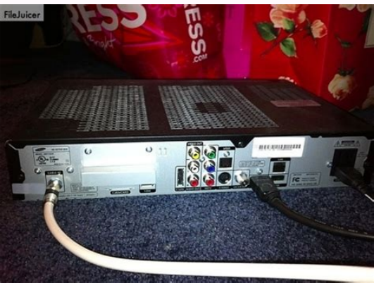
Cablevision channel listing. Cablevision tv listings. Cablevision optimum channel guide.